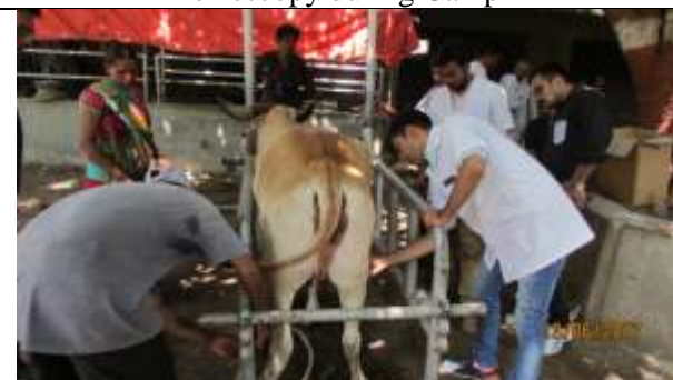
Ruminotomy and different surgical interventions during Camp